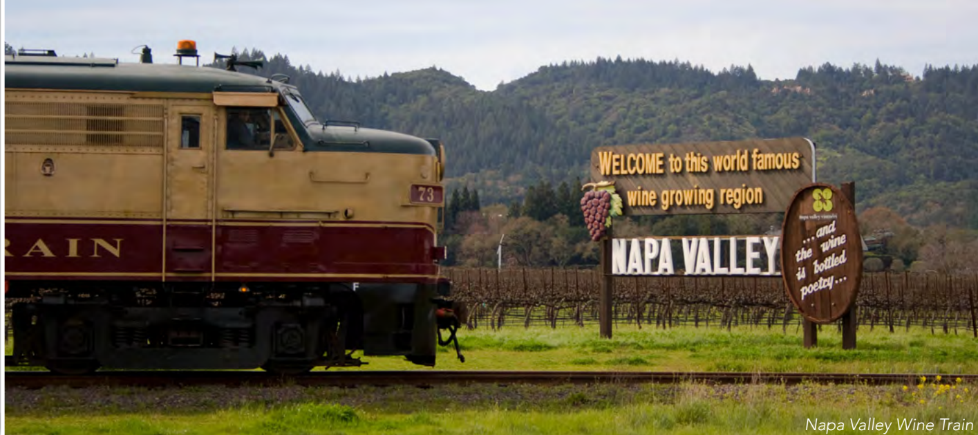
Napa Valley Wine Train

The Napa Valley railway dates back to the late 19th century and eventually became part of the Southern Pacific Railroad (the original passenger service was discontinued in 1929). Sixty years later, when Southern Pacific petitioned to abandon the line, a group of local investors formed the Napa Valley Railroad (NVR) and purchased the right of way. Since that time, the NVR has evolved into one of the most popular excursion trains in the country. The Wine Train's gourmet lunch and dinner trains began service in 1989 and the line, which now includes 36 miles of track, rolls by 26 different wineries at about 10 miles an hour (the trip, which lasted just shy of three, started and ended at the downtown Napa station).