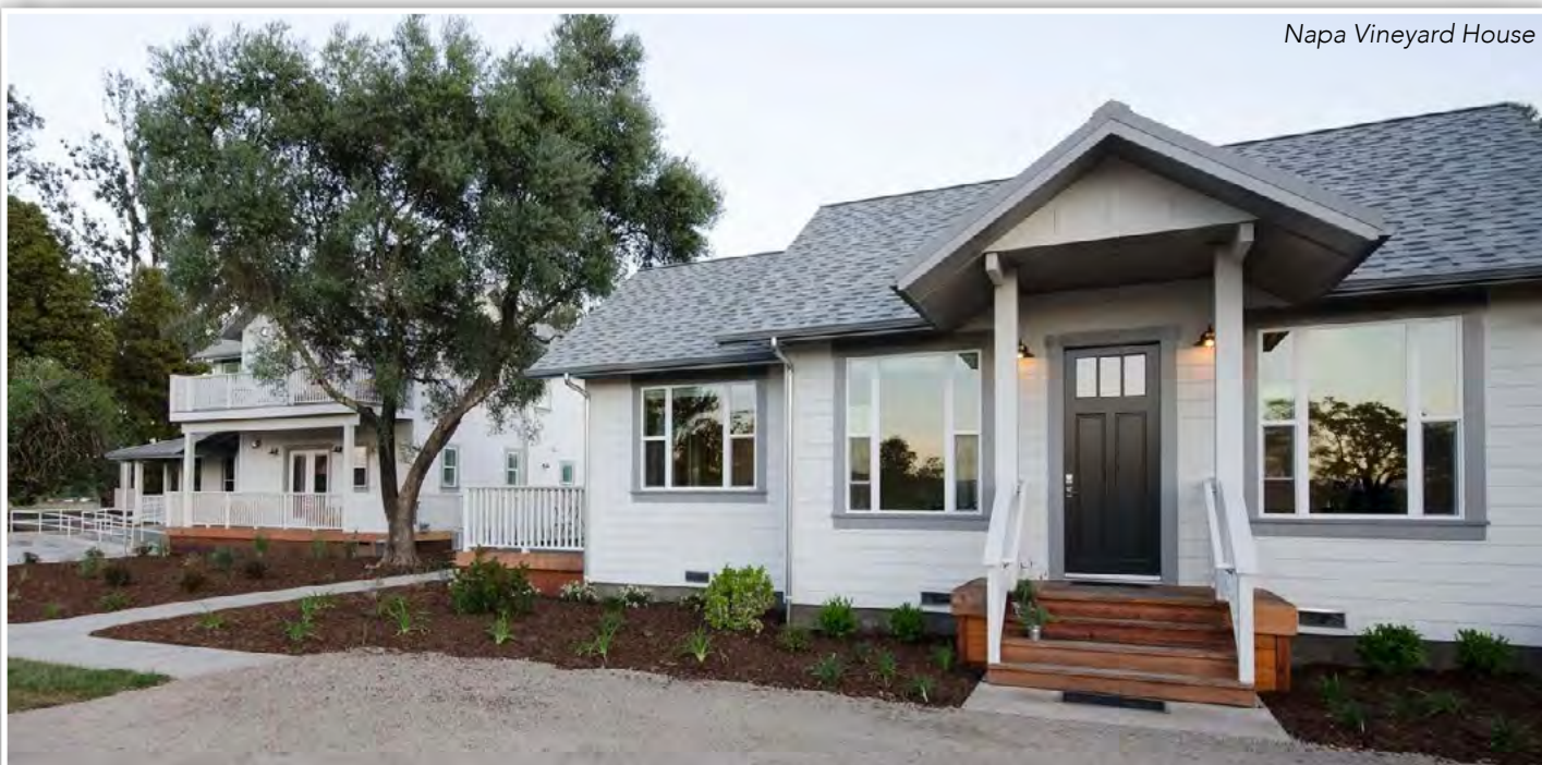
Napa Vineyard House

We really lucked out in discovering a wonderful accommodation within easy driving distance to downtown Napa, tasting rooms and wineries. Because we have family friends who live in the area, we've been blessed to be