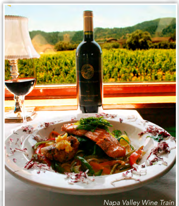
Napa Valley Wine Train

Napa is known for its panoramic vistas, fine dining and history. So what better way to experience the views and vintages, enjoy a gourmet meal and step back in time to the days when rails ruled as the preferred mode of travel than to step aboard the Napa Valley Wine Train ( www.winetrain.com )?